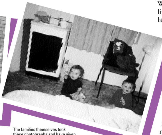
The families themselves took these photographs and have given permission for them to be reproduced here.