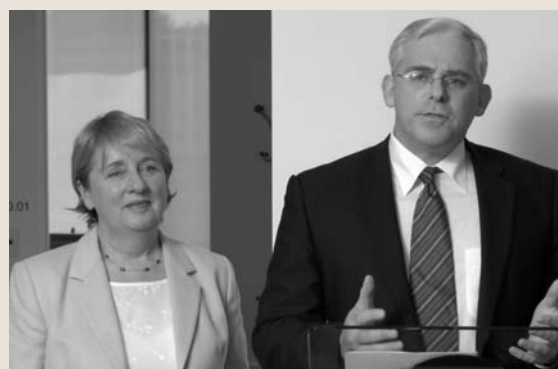
The Hon. Jenny Macklin and the Hon. Anthony Byrne speaking at the opening of the Institute