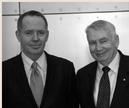
Professor Peter Whiteford (left) and Reverend the Hon. Professor Brian Howe