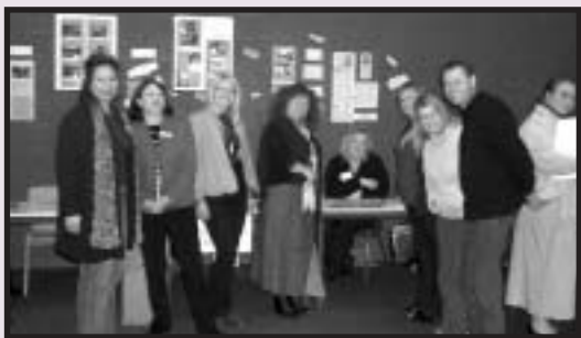
QRA Display at Peel Resource Expo.