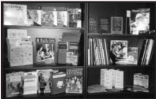
QRA Resource Centre.